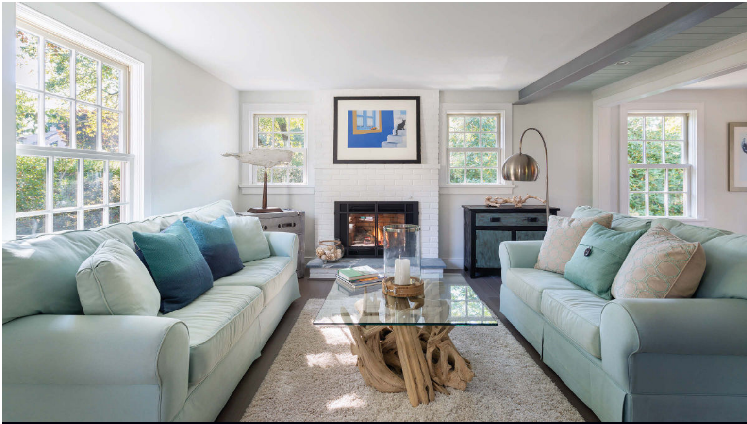
TOP: A wide open floor plan keeps this modest, Narragansett Cape feeling roomy and relaxed. BOTTOM: The white painted brick fireplace surround is reminiscent of the white subway tile in the kitchen, and a new gas insert in the pre-existing fireplace adds interest and warmth. OPPOSITE PAGE: The kitchen design is simple and clean. White subway tiles and cabinets keep the room bright and allow the sea glass green island to pop. Soapstone counters mimic the gray wash of the bamboo floors. The beadboard ceiling, painted a soft blue, is a nice finishing detail.